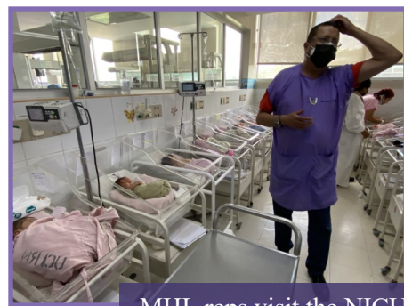
MHL reps visit the NICU of Hospital Escuela