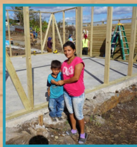
mother & son await their home

The 32-member team built 3 homes & 32 beds; distributed 3,136 pounds of donated materials; gave the children homemade jump ropes; handed out several hand-sewn skirts; taught women to knit infants' stocking hats. They also created life-changing memories for the Hondurans, and, most especially, for themselves.