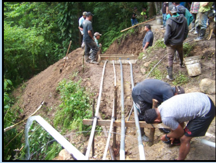
water project in La Ceiba

As Mission Honduras and Then Feed Just One directors, we try to live up to the very values that guide these programs - values that you may also hold: Collaboration and Partnership with the Honduran people; Compassion , Kindness , and Love , in serving our fellow brothers and sisters in Honduras; Integrity and Excellence , as we manage these programs to the highest possible quality, no matter the challenges; Accountability and Honesty in how we manage your supporting dollars, and lastly; Respect and Humility for all of God's children worldwide.