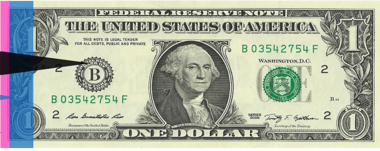
How did we spend each dollar you donated?