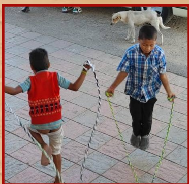
using jump ropes made of t-shirts