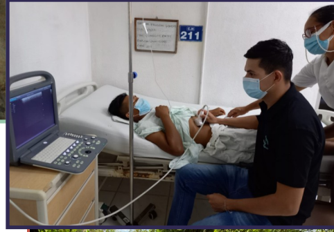
delivering medical equipment to Montaña de la Flor

Malnutrition is the underlying contributing factor in nearly half the deaths of children under 5.