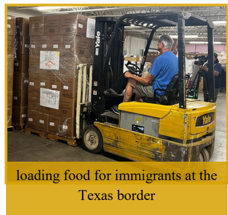
loading food for immigrants at the Texas border

Overcoming poverty is not a gesture of charity. It is an act of justice. It is the protection of a fundamental human right, the right to dignity and a decent life.