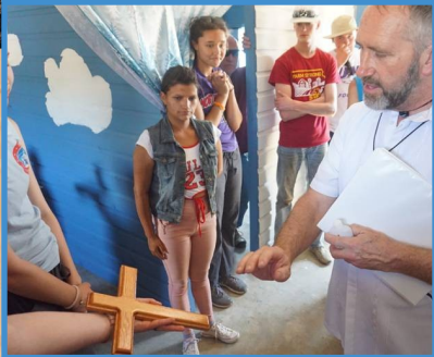
cross blessing for the new home