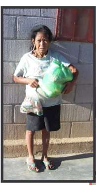
distributing TFJO food in Honduras