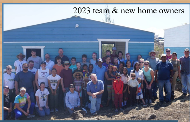
2023 team & new home owners