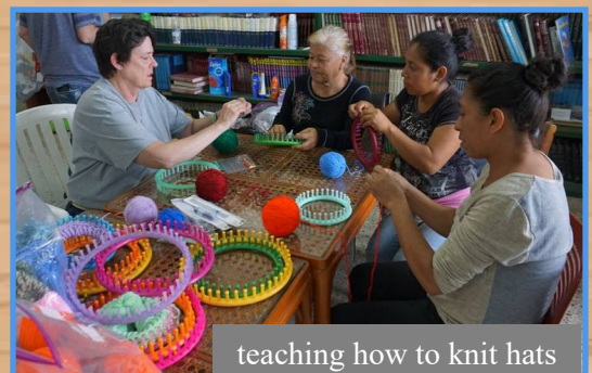
teaching how to knit hats