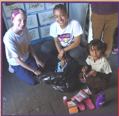
delivering gift bags to families

When we love others, we're living the truth of God out loud.